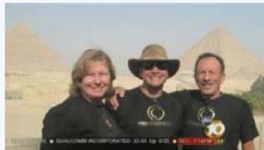
Video: Local Couple Speaks On Experiences With Self-Help Guru